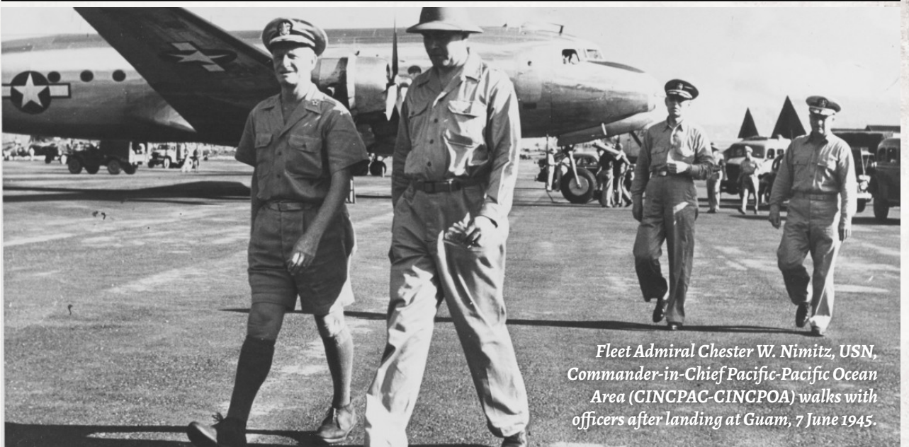
Fleet Admiral Chester W. Nimitz, USN, Commander-in-Chief Pacific-Pacific Ocean Area (CINCPAC-CINCPAA) walks with officers after landing at Guam, 7 June 1945.